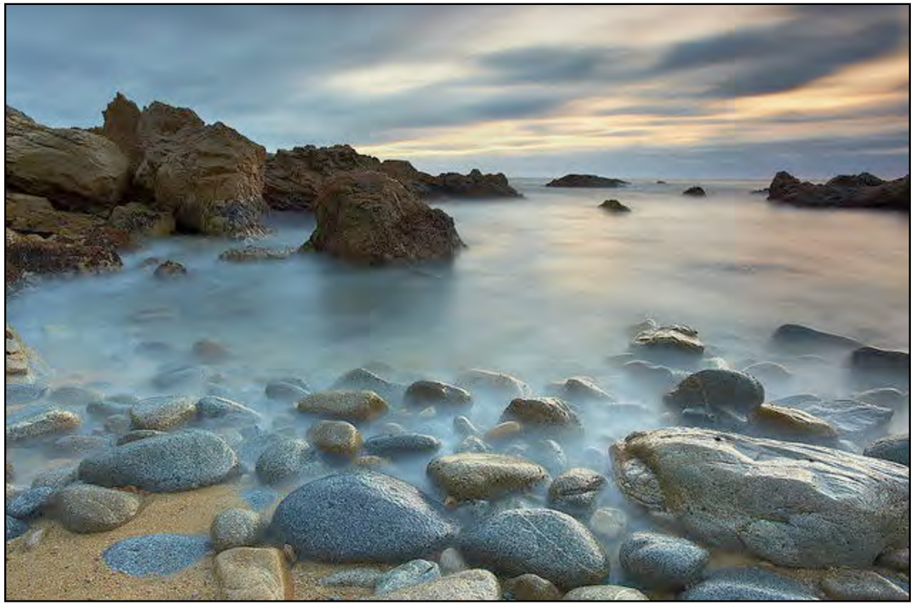
National Geographic water images